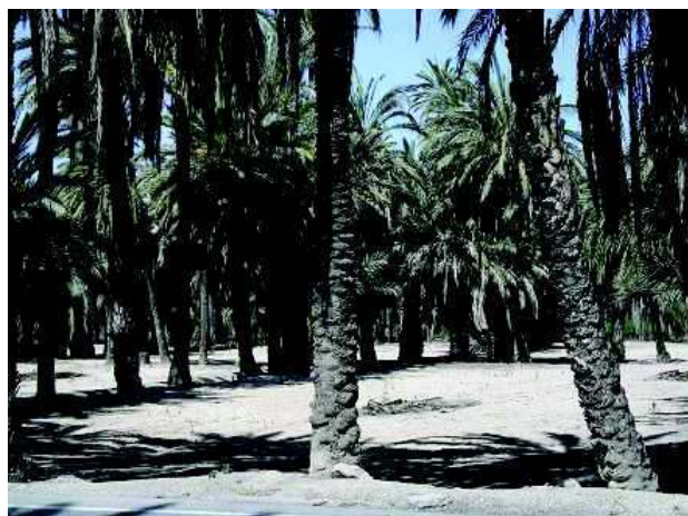
Figure 5 : Huerto with no agricultural function.

Currently, about two thirds of urban huertos are owned by the City Council. Their recovery and maintenance involve a significant economic burden, which is mainly borne by the municipal authority. It has been suggested the development of certain activities in these spaces, conducted also by the private sector, which may be a factor to attract visitors and ensure the economic sustainability of this cultural landscape. This proposal, which is not free of controversy, must be consistent with the objective of enhancing the urban huertos in their original configuration as agricultural land. In this regard, the Special Protection Plan for the Palmeral proposes the allowance of provisional constructions destined to house tourist and leisure activities and others related to the spreading of the culture on this agrosystem, like interpretation centres, exhibitions, workshops on traditional craft or the sale of huerto products, provided they do not affect its physical structure 57 .