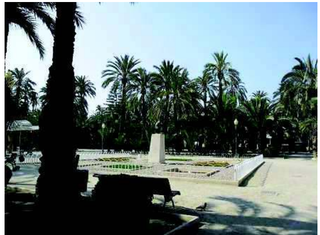
Figure 4 : Former huerto transformed into a park.

At that time, the City Council started to move into a more comprehensive management of the urban Palmeral. This new approach was reflected in the General Urban Development Plans of 1986 and, specially, 1998. Among the new measures 44 , it is worth mentioning the acquisition by the Local Government of non-transformed private huertos in order to turn them into public spaces. As a result, the main alteration undergone by the urban Palmeral during the last years of the twentieth century was the transformation of huertos into public parks and gardens 45 . However, this measure has not been totally consistent with the heritage protection, as some actions have affected their agricultural nature. In that regard, traditional elements of this agrosystem have been eliminated or modified, and others related to their new recreational function, like urban furniture, have